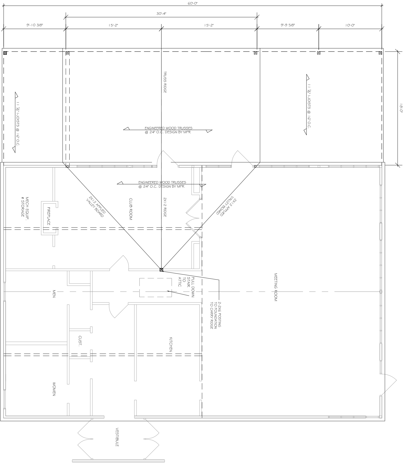
2 ROOF PLAN 1/8" = 1'-0"